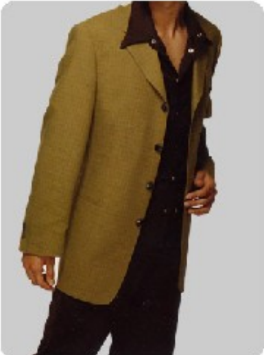
Single Breasted 4 Buttons Italian Style