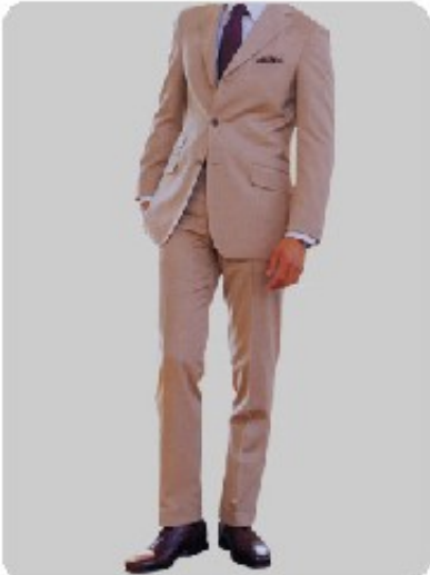
Single Breasted 3 Buttons British Style