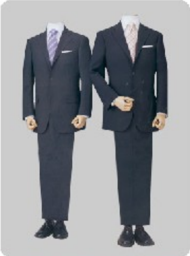
Single Breasted 2 Buttons Classic Style